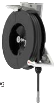
Reel with arms in ceiling mounting position.